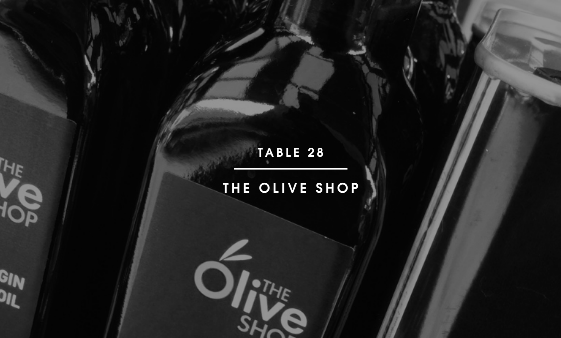
TABLE 28 THE Olive SHOP