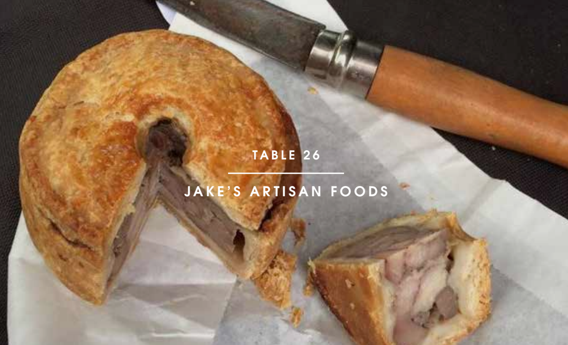
TABLE 26 JAKE'S ARTISAN FOODS

Jake's Artisan Foods has redefined the English pork pie, elevating it to glorious new heights. Crammed with succulent pieces of perfectly seasoned free-range pork in a classic hot-water crust, each one is proudly made by hand just outside Petersfield in East Hampshire.