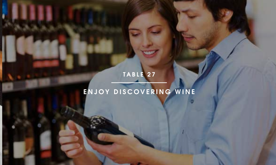
TABLE 27 ENJOY DISCOVERING WINE

Enjoy Discovering Wine are Approved Programme Providers of Wine & Spirit Education Trust Courses (WSET) in the South Coast area.